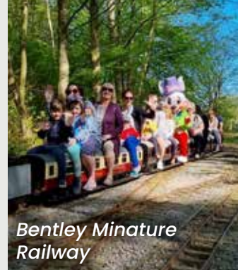
Bentley Minature Railway

In the High Weald the frequent passage of pigs being driven to and from their dens formed tracks known as droves and over time the dens became settlements in their own right!