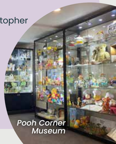
Pooh Corner Museum

Pablo Picasso stayed at Farley House & Gallery in 1950.