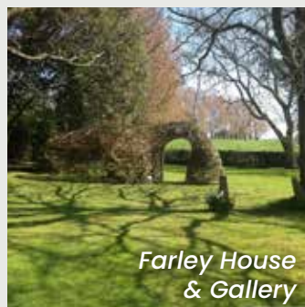
Farley House & Gallery

Gaze at the amazing work by the surrealist artist's Lee Miller, renowned photographer and Roland Penrose, English painter and poet who both lived at Farley House & Gallery . The House